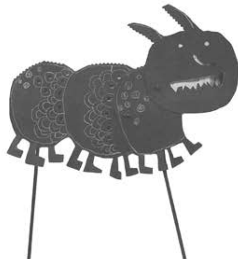
An Indonesian rod puppet

22 With a marionette, the controls are above and the puppet hangs down . . .