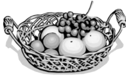
Basket A 12kg

1. The weights of 3 fruit baskets are shown below.