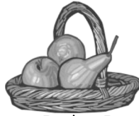
Basket B 8kg