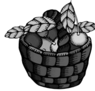
Basket C 16kg